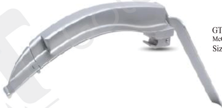
GT-500-61 McCoy Blade Fiber Optic Illumination Size: 3