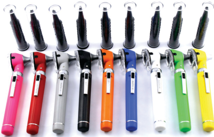
GT-500-89 Mini Otoscope standard optic