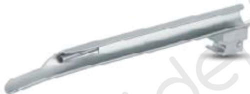
GT-500-33 Miller Blade Fiber Optic Illumination Size: 2