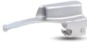
GT-500-42 Mc - Intosh Blade Fiber Optic Illumination Size: 0