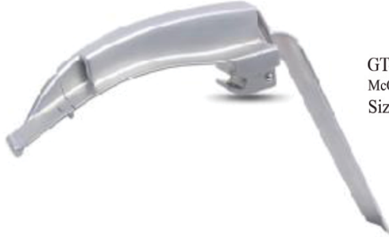
GT-500-59 McCoy Blade Fiber Optic Illumination Size: 1