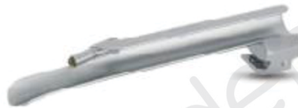
GT-500-23 Miller Blade Standard Illumination Size: 1