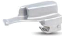
GT-500-41 Mc - Intosh Blade Fiber Optic Illumination Size: 00

Sets available in hard case or soft pouch