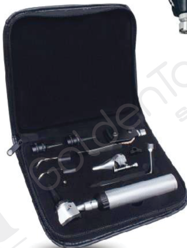
GT-500-67 ENT Set Complete