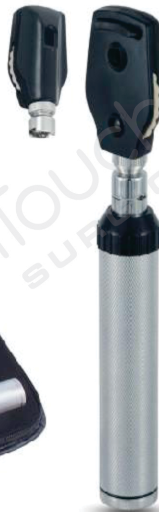
GT-500-68 Brass Ophthalmoscope