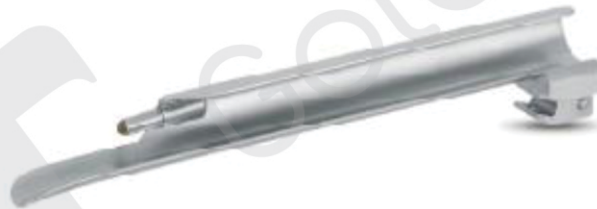
GT-500-24 Miller Blade Standard Illumination Size: 2