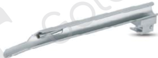
GT-500-34 Miller Blade Fiber Optic Illumination Size: 3