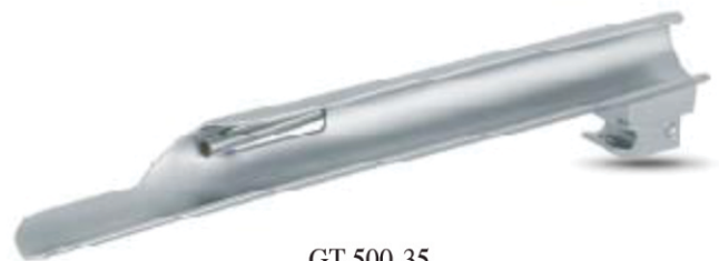
GT-500-35 Miller Blade Fiber Optic Illumination Size: 4