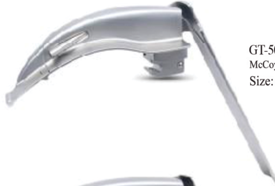
GT-500-52 McCoy Blade Fiber Optic Illumination Size: 1