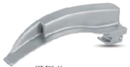
GT-500-46 Mc - Intosh Blade Fiber Optic Illumination Size: 4