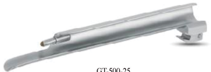
GT-500-25 Miller Blade Standard Illumination Size: 3