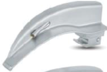
GT-500-12 Mc - Intosh Blade Fiber Optic Illumination Size: 1