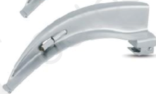
GT-500-04 Mc - Intosh Blade Standard Illumination Size: 3