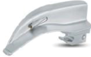
GT-500-11 Mc - Intosh Blade Fiber Optic Illumination Size: 0