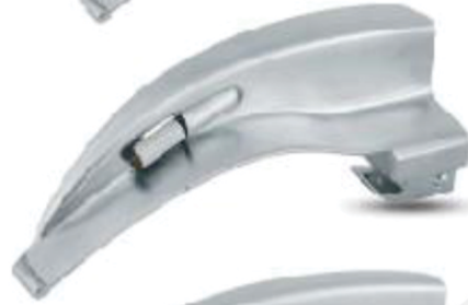
GT-500-02 Mc - Intosh Blade Standard Illumination Size: 1