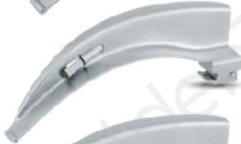
GT-500-03 Mc - Intosh Blade Standard Illumination Size: 2