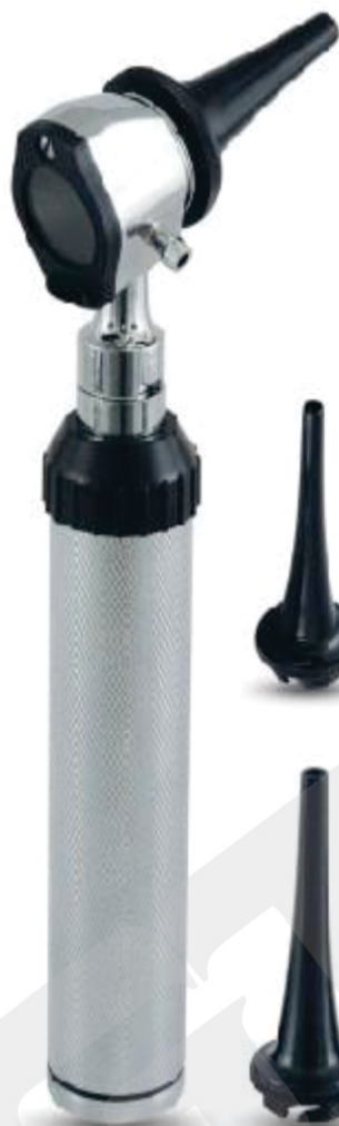
GT-500-66 Brass Otoscope Fiber Optic Brass Otoscope Conventional