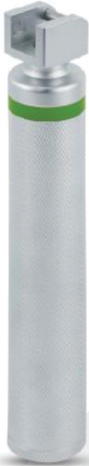
GT-500-47 Handle Fiber Optic Illumination Size: Adult Handle options: Child & Stubby