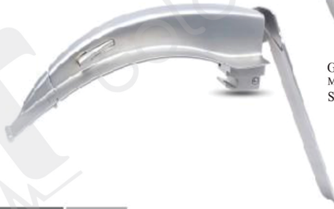
GT-500-54 McCoy Blade Fiber Optic Illumination Size: 3