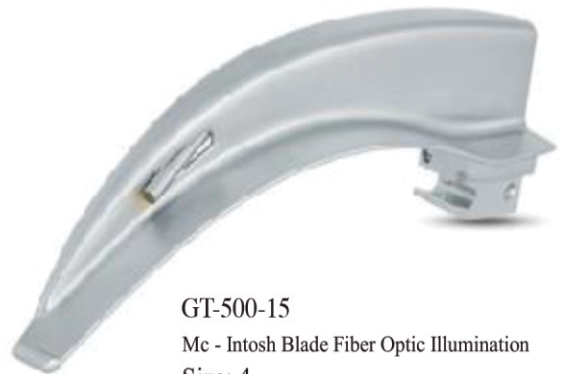
GT-500-15 Mc - Intosh Blade Fiber Optic Illumination Size: 4