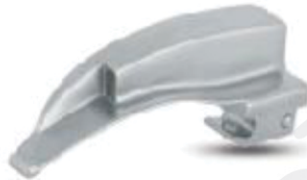
GT-500-43 Mc - Intosh Blade Fiber Optic Illumination Size: 1