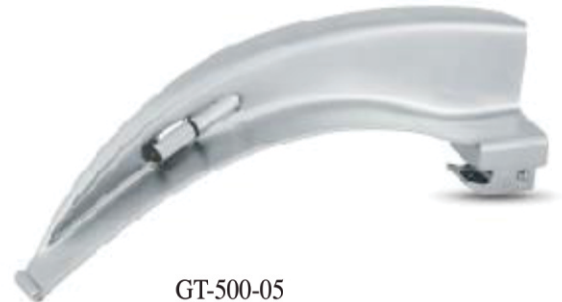
GT-500-05 Mc - Intosh Blade Standard Illumination Size: 4