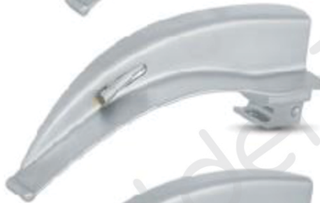
GT-500-13 Mc - Intosh Blade Fiber Optic Illumination Size: 2