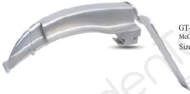
GT-500-60 McCoy Blade Fiber Optic Illumination Size: 2