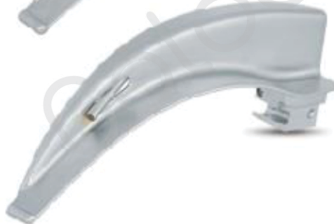
GT-500-14 Mc - Intosh Blade Fiber Optic Illumination Size: 3