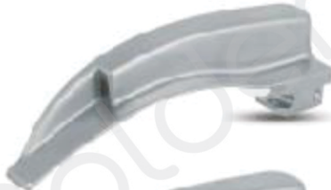
GT-500-44 Mc - Intosh Blade Fiber Optic Illumination Size: 2