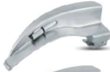
GT-500-01 Mc - Intosh Blade Standard Illumination Size: 0