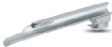
GT-500-32 Miller Blade Fiber Optic Illumination Size: 1