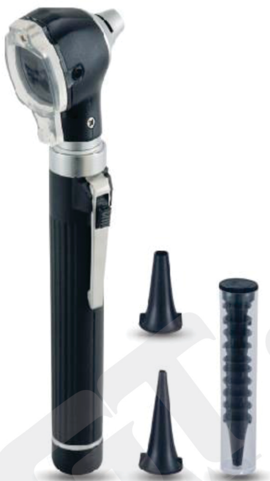
GT-500-69 Mini Otoscope Fiber Optic Complete Set of Disposable Cannulas