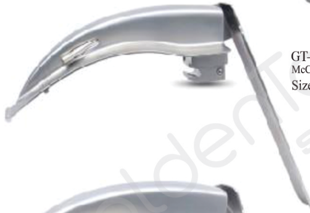
GT-500-53 McCoy Blade Fiber Optic Illumination Size: 2