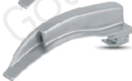
GT-500-45 Mc - Intosh Blade Fiber Optic Illumination Size: 3